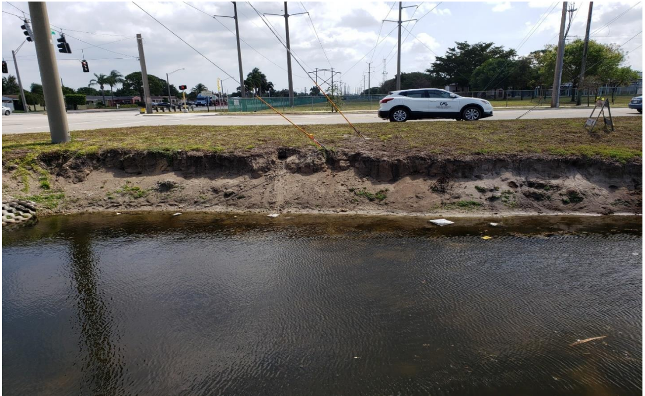
Photo 5: Culvert and canal bank erosion at Sheridan Street and N 72 Avenue.