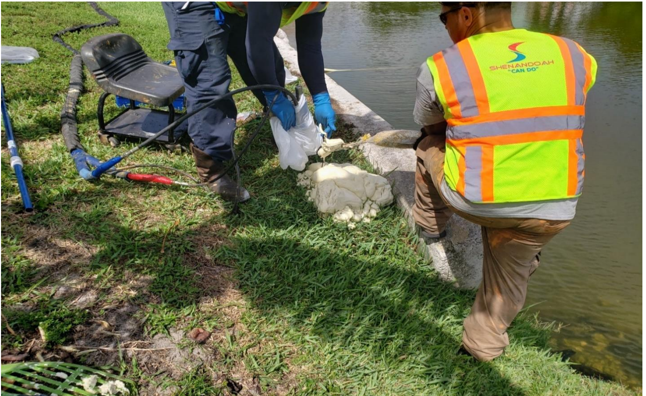
Photo 2: Installation of polyurethane foam resin behind existing lake headwall.