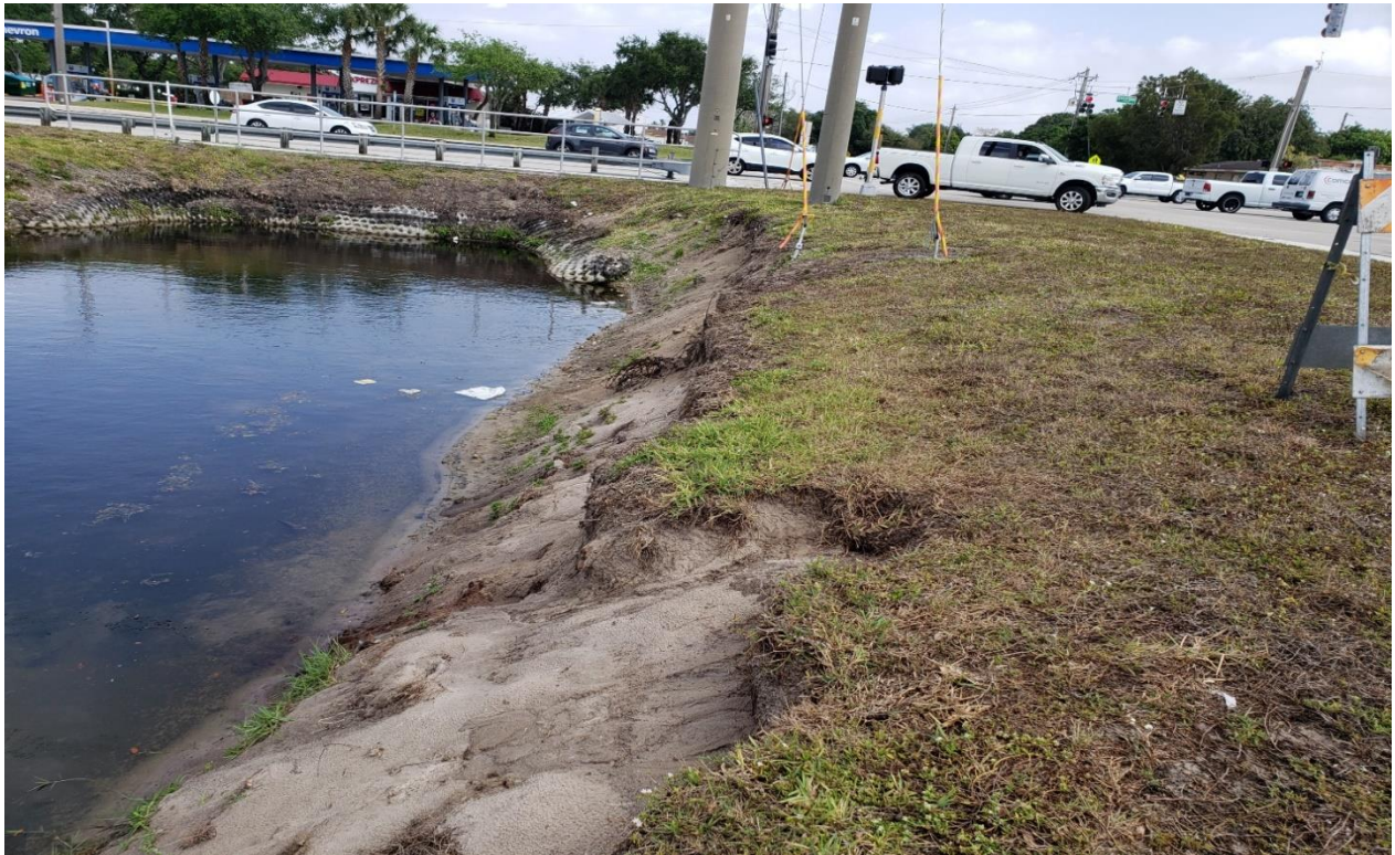
Photo 4: Culvert and canal bank erosion at Sheridan Street and N 72 Avenue.