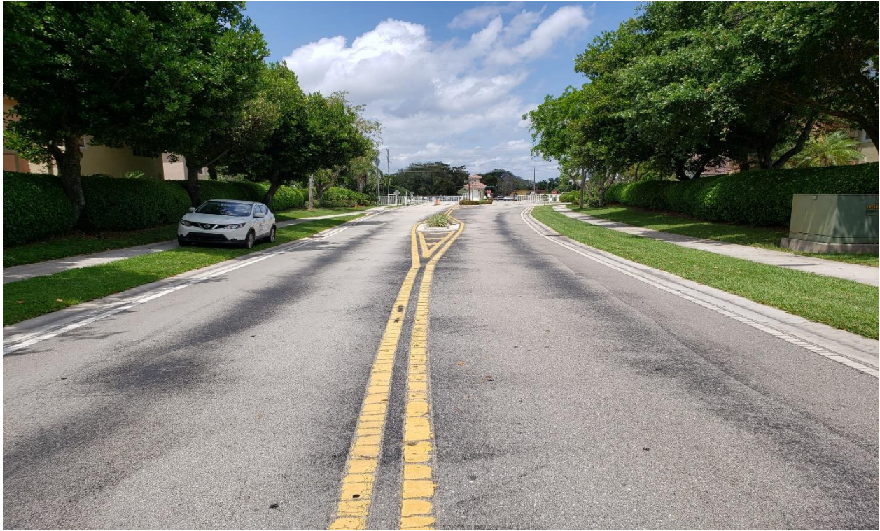
Photo 11: Sealcoating and restriping of internal WCCDD roads is scheduled for FY 2021.