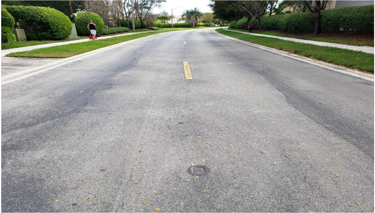
Photo 9: Sealcoating and restriping of internal WCCDD roads is scheduled for FY 2021.