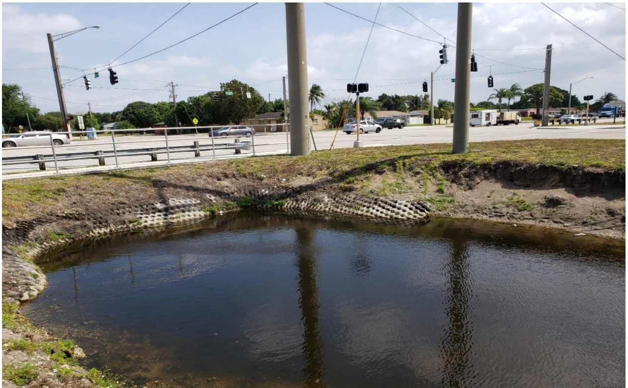
Photo 6: : Culvert and canal bank erosion at Sheridan Street and N 72 Avenue.