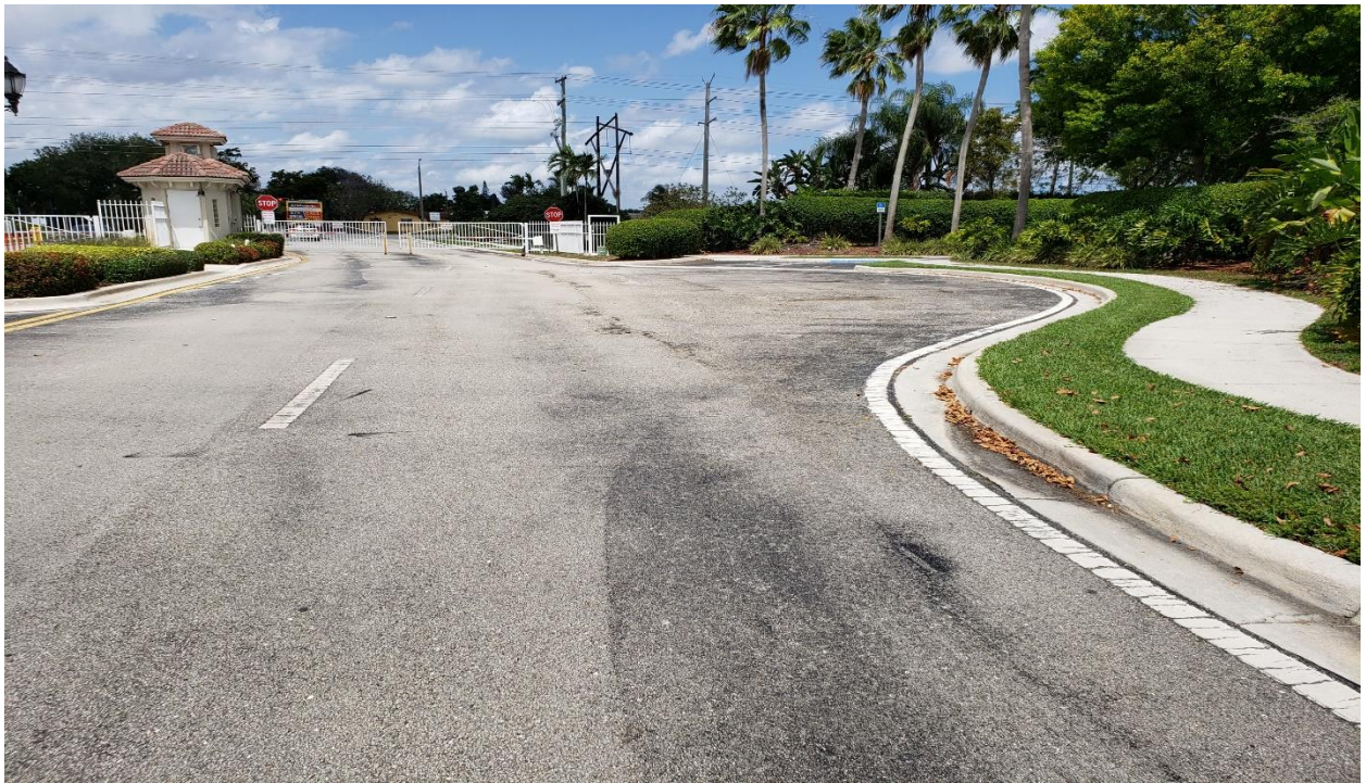
Photo 12: Sheridan Street exit at NW 76 th Avenue is scheduled for sealcoating in FY 2021 .