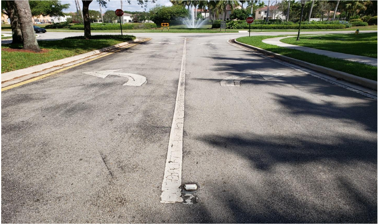
Photo 7: Sealcoating and restriping of internal WCCDD roads is scheduled for FY 2021.