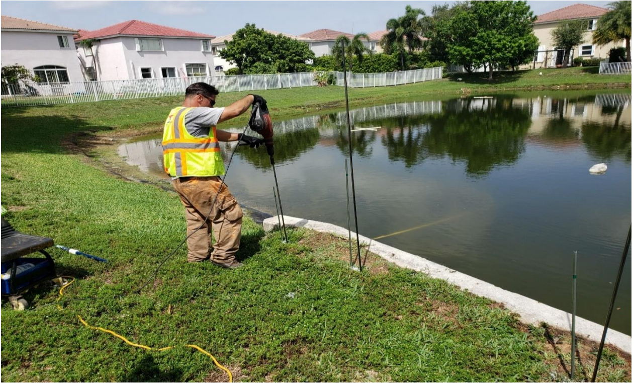
Photo 1: Predrilling for foam resin injection to stabilize headwalls.